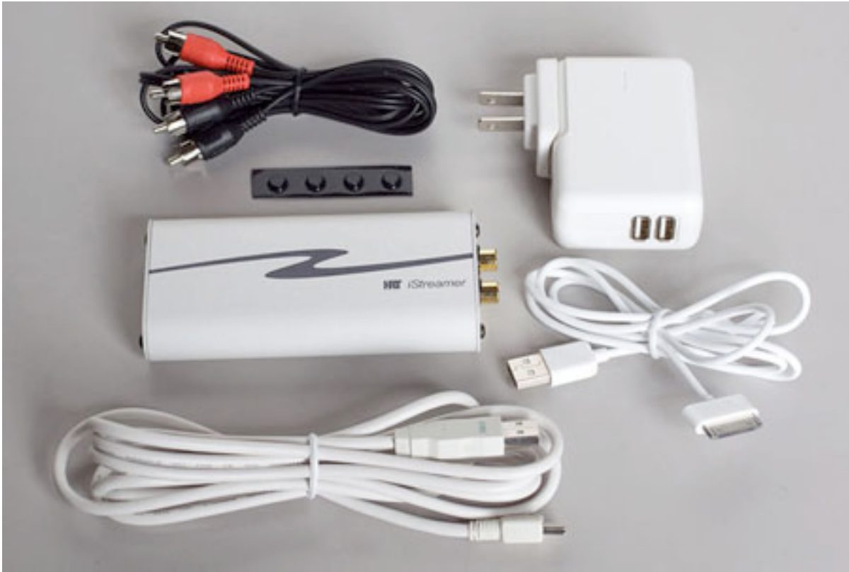
Above: iStreamer parts w/115VAC power supply. Below: 12VDC power supply/adaptor for vehicles