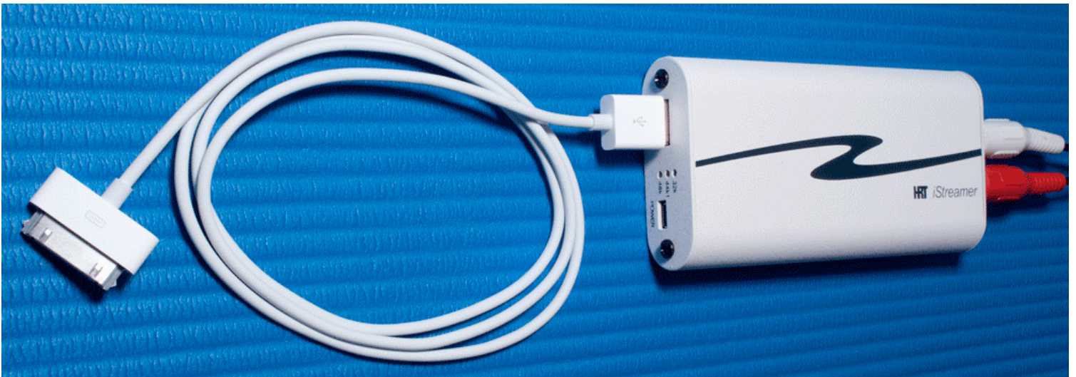
Above: iStreamer with HRT Synch cable attached